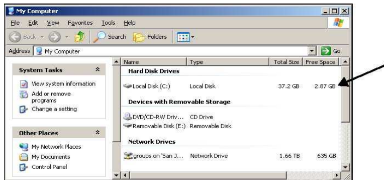
Figure 2 Sample PC hard drive free space details