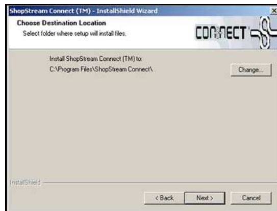
Figure 5 Sample Choose Destination screen

The Ready to Install the Program screen displays (Figure 6).