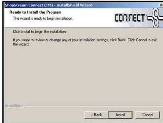
Figure 6 Sample Ready to Install Program screen

The Setup Status screen tracks progress as the program installs (Figure 7).