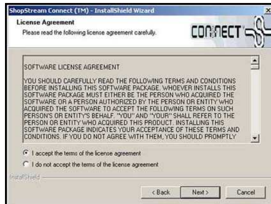
Figure 4 Sample License Agreement screen

The Choose Destination Location screen displays (Figure 5).