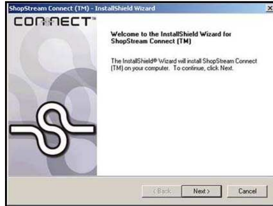
Figure 3 Sample Welcome screen

The License Agreement screen displays (Figure 4).