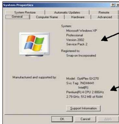
Figure 1 Windows XP System Properties dialog box